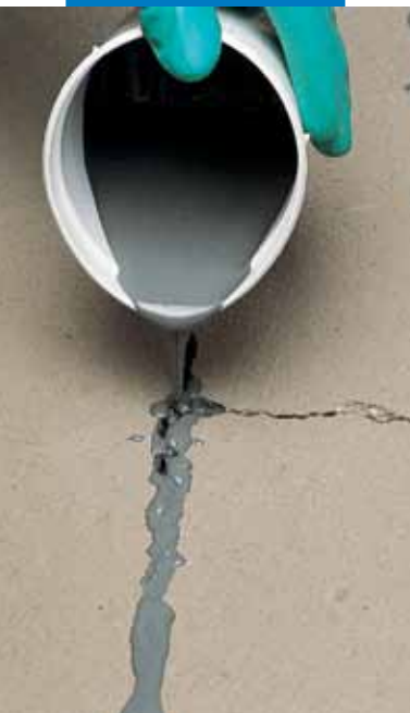
Repairing a crack in cement screed with Eporip