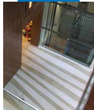
Hotel Design - Budapest - Hungary. "Terrazzo alla veneziana" effect Ultratop