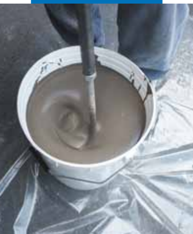
Preparation of the product with a drill