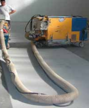
Preparation of the substrate by shot-blasting

Spread Ultratop by hand or with a mechanical means (rendering machine with a worm-screw feeder) in a single layer of 5 to 40 mm and a smoother for a natural finish, or at a thickness between 10 and 40 mm if the floor is to be polished. Make sure that the material is cast in a regular, continuous flow without interruptions, to avoid defects in flatness and particularly visible differences in colour. Thanks to its self-levelling properties, Ultratop eliminates all imperfections left by the smoother.