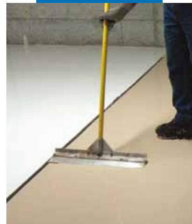
Smoothing Ultratop immediately after spreading