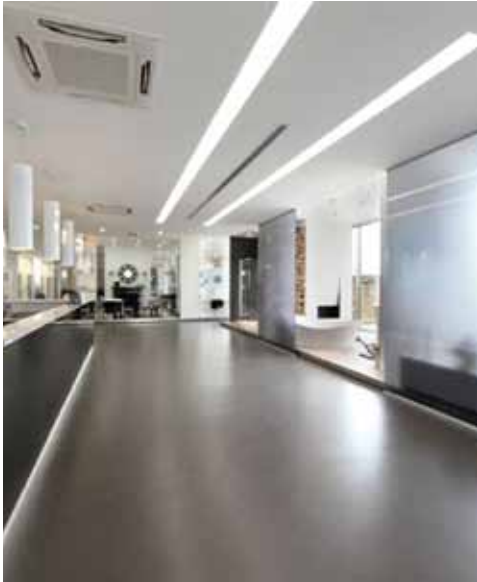
Show-Room Quartarella Altamura (BA) - Italy. "Natural effect" anthracite Ultratop

be grouted using Ultratop Stucco after the "roughing" cycle.