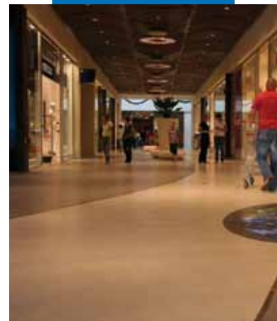
The final result of a floor made using Ultratop