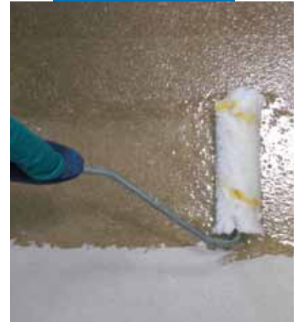
“Terrazzo alla veneziana” effect. Application of Mapefloor I 910