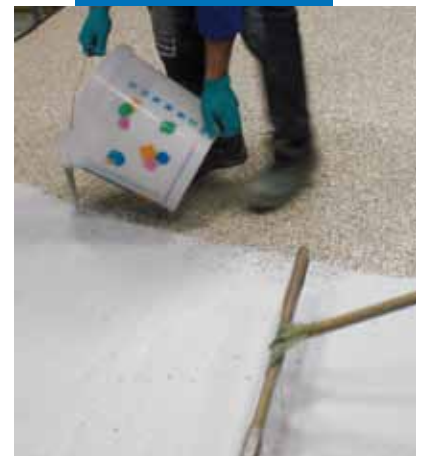
Application of Ultratop on the hardened surface of the mixture made of natural aggregates + Mapefloor 910