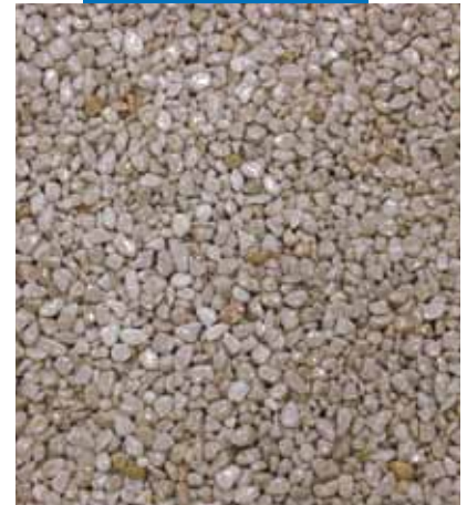
Application of the mixture of natural aggregates + Mapefloor I 910