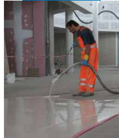
Mechanical application of Ultratop