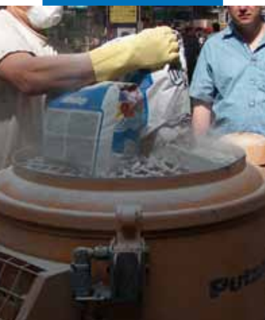
Preparation of Ultratop in a mixer